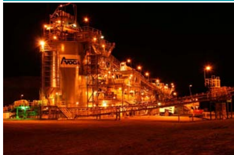
Chart 1: Avoca's Higginsville Treatment Plant